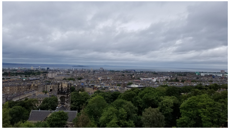
From Hume's Walk, I went down into Edinburgh and back up the Royal Mile

and the view of the coast from the North Atlantic back inland to the Firth of the Forth where the Technical Tour of the Forth Bridge Crossing would late Friday.