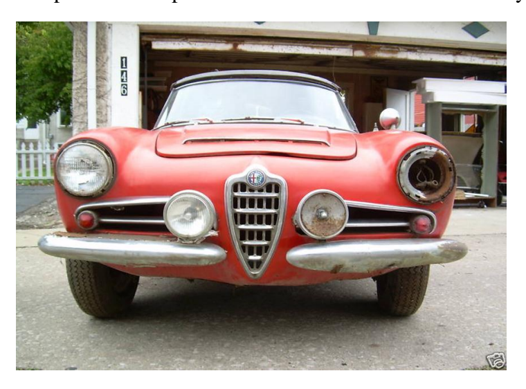
Figue 3. The missing headlight

conditions are determined by specifications? This example generated a lot of discussion regarding the identity criteria for an implementation of the automobile design. Can components be replaced within a unit without the identity of the unit changing?