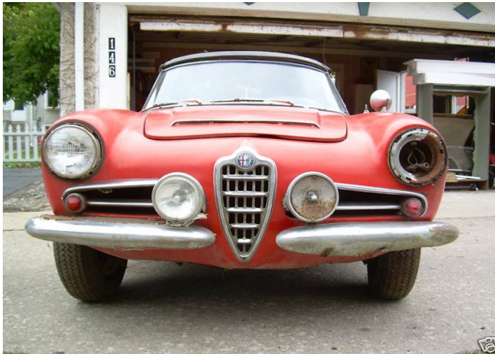
Figure 3. The missing headlight

specific left headlight component. These system components do not behave in the same way as ordinary physical objects. If a headlight is smashed does the automobile still have a headlight component (figure 3)? When the left headlight of an automobile is removed, a technician still says that an electrical cable connects to the left headlight. What do engineers actually speak of when they talk about connections to the missing left headlight and what do they have in mind when they speak this way? Do they have in mind objects whose existence conditions are determined by specifications? This example generated a lot of discussion regarding the identity criteria for an implementation of the automobile design. Can components be replaced within a unit without the identity of the unit changing?